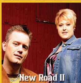
New Road II