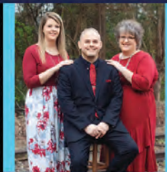
Heaven Bound Trio