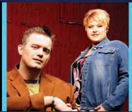
New Road 2