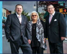
The Porter Family