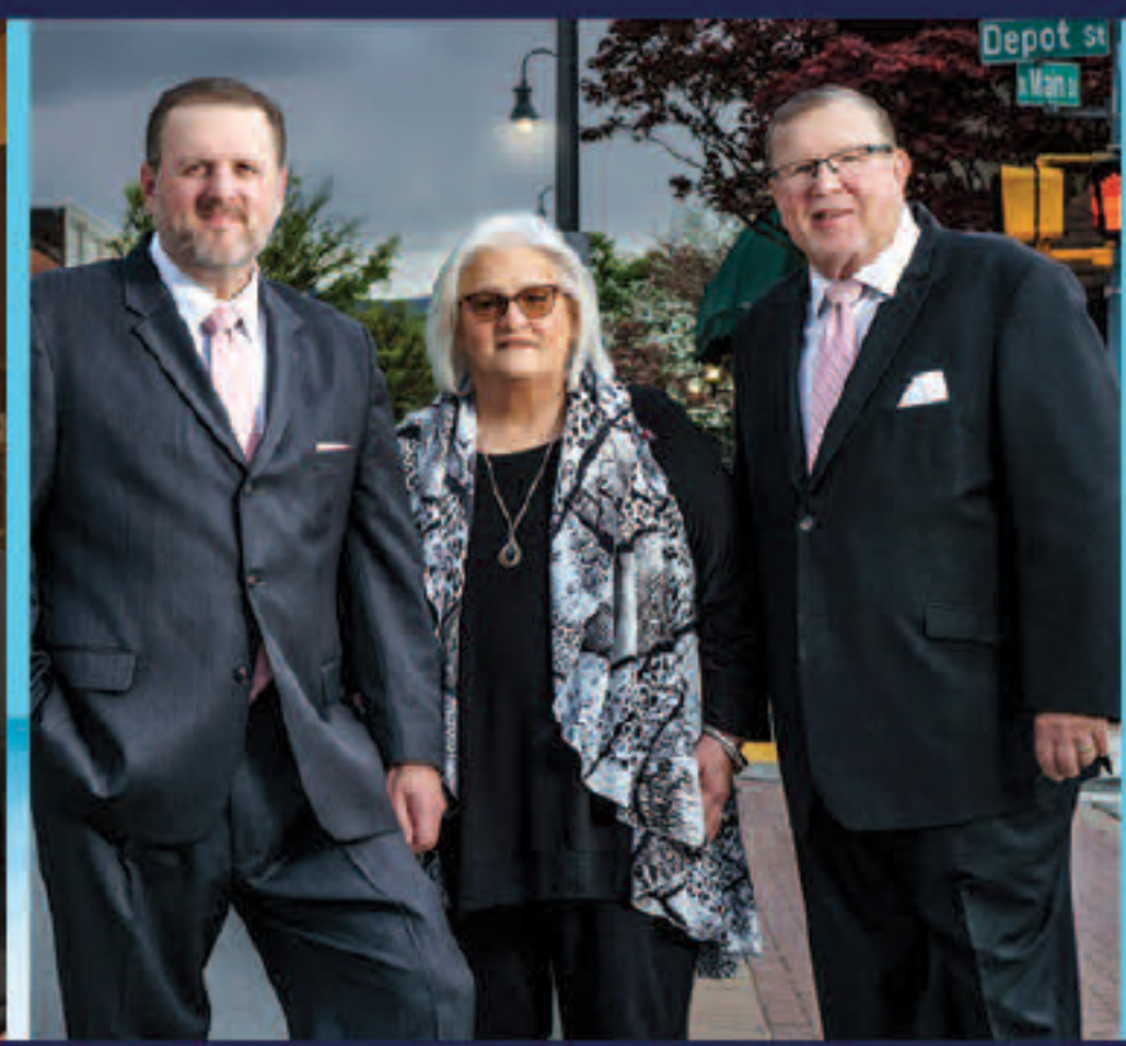
The Porter Family