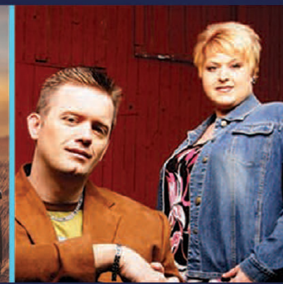
New Road 2