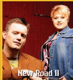
New Road II