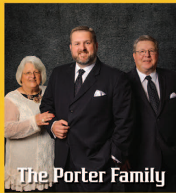
The Porter Family