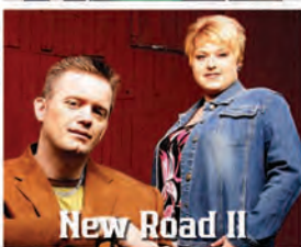
New Road II